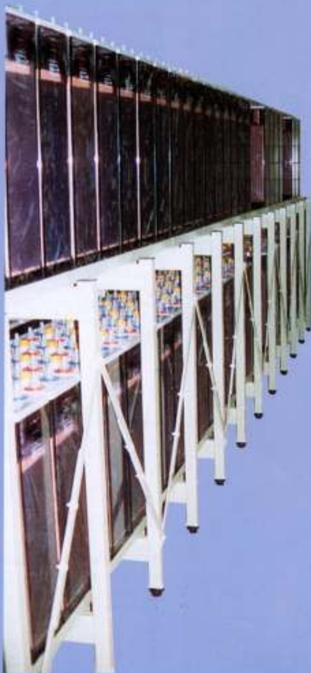
Racks for VR horizontal battery installation

alpha industrie-bedarfs gmbh Hüttenstraße, 5 67350 Worms - Germany Tel. + 49 6242 91119-0 Fax + 49 6242 91119-19 E-mail: info@alpha-passoni.de Int.: http://www.alpha-passoni.de