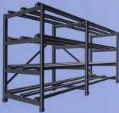
Racks for VR battery installation